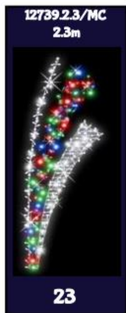
St John's column lights

All of the lights in Worcester are LED and consume very little energy compared to the old filament lights which were traditionally used at Christmas. Running costs of these LED lights compared to filament lights provide a saving of around 85% - 90%.